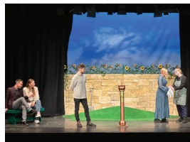
Past performances from the SCDA Edinburgh District Festival.